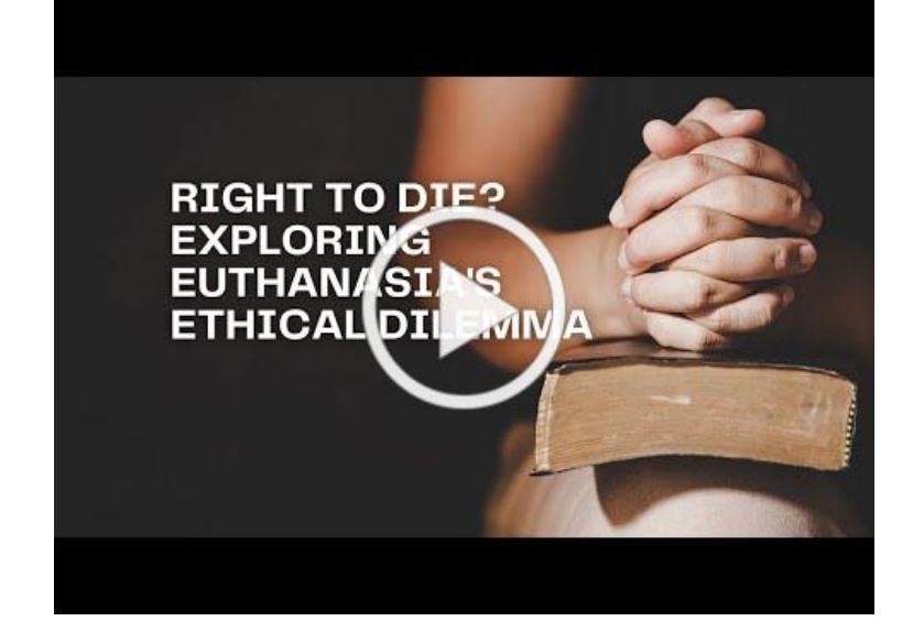
Click on the Video to Watch Now