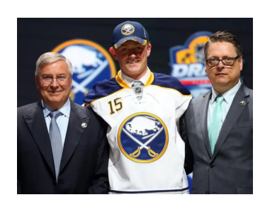
NHL Players Aim to Bring CBA into Compliance with Bioethics