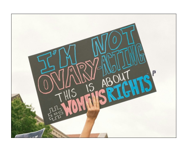
Why the Principles of Bioethics Require Emergency Abortion Protections