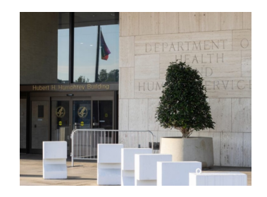
When Bioethics is Like Surfing: Changing Federal Policy